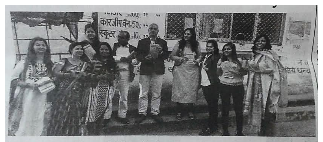
Doon University's School of Management's students and faculties were seen making an appeal to the travellers with note "all the travellers are requested not to throw bottles of mineral water, cold drinks, cane, polythene and plastic material on road, please help to save environment" under the banner of make india clean and Make India developed at Kuthal Gate on way to Mussorie on Friday