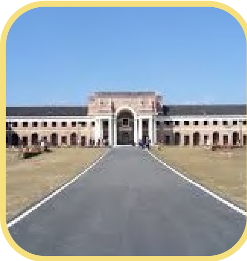
Forest Research Institute